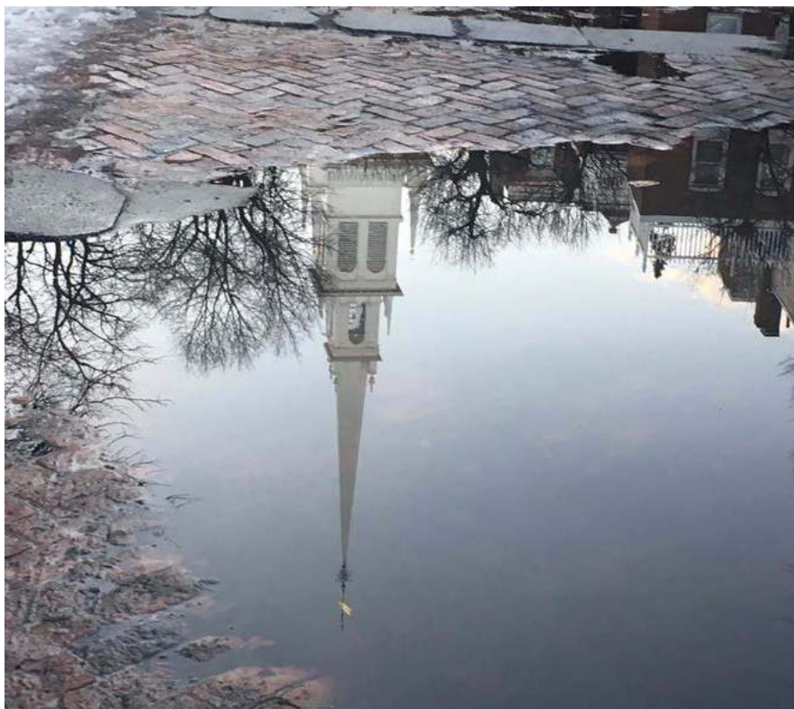
Church at Sunset, photograph