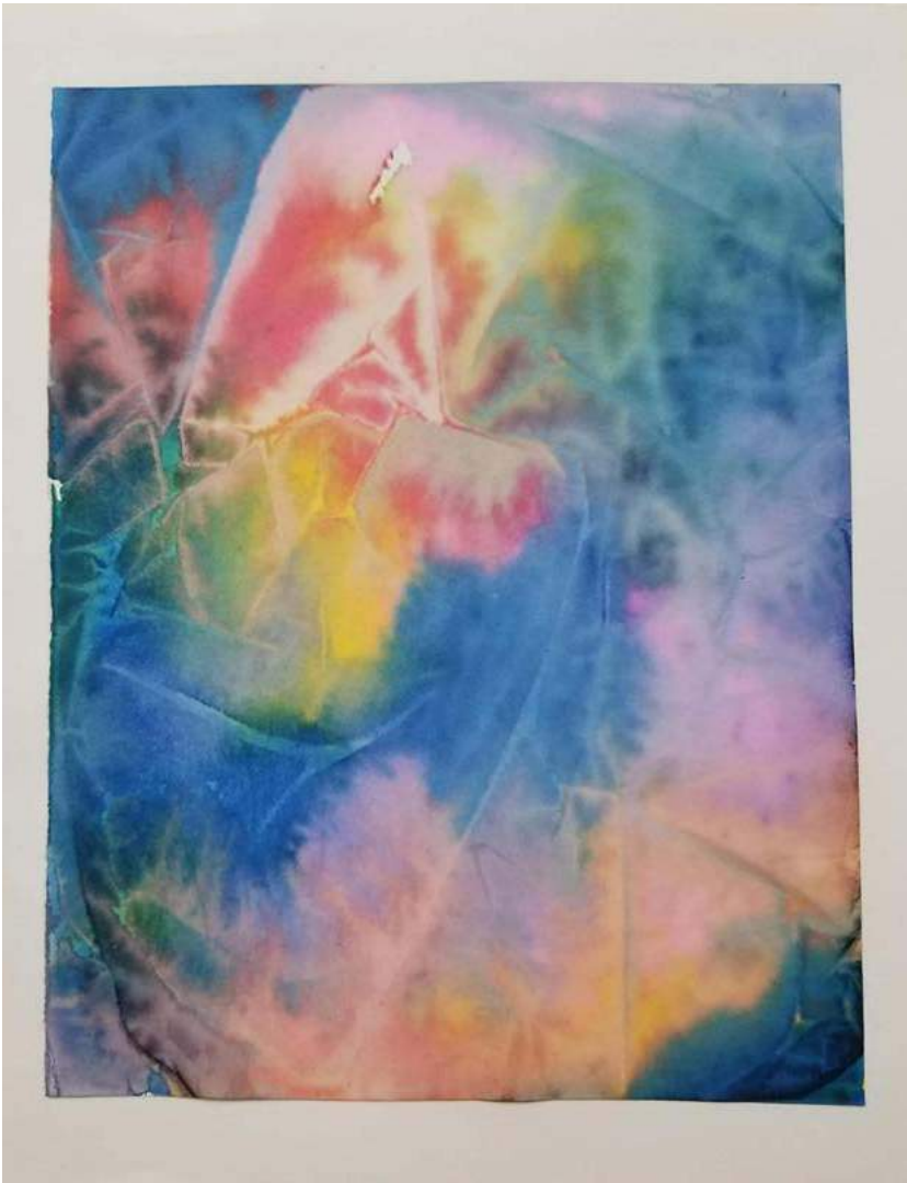
Untitled, tempera, watercolor, cellophane