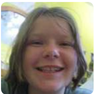
by Ula Pomian, 12 Ontario, Canada