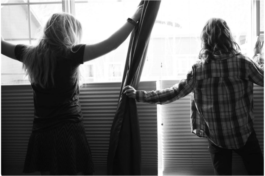
Peering Out , photograph, Nikon D3400