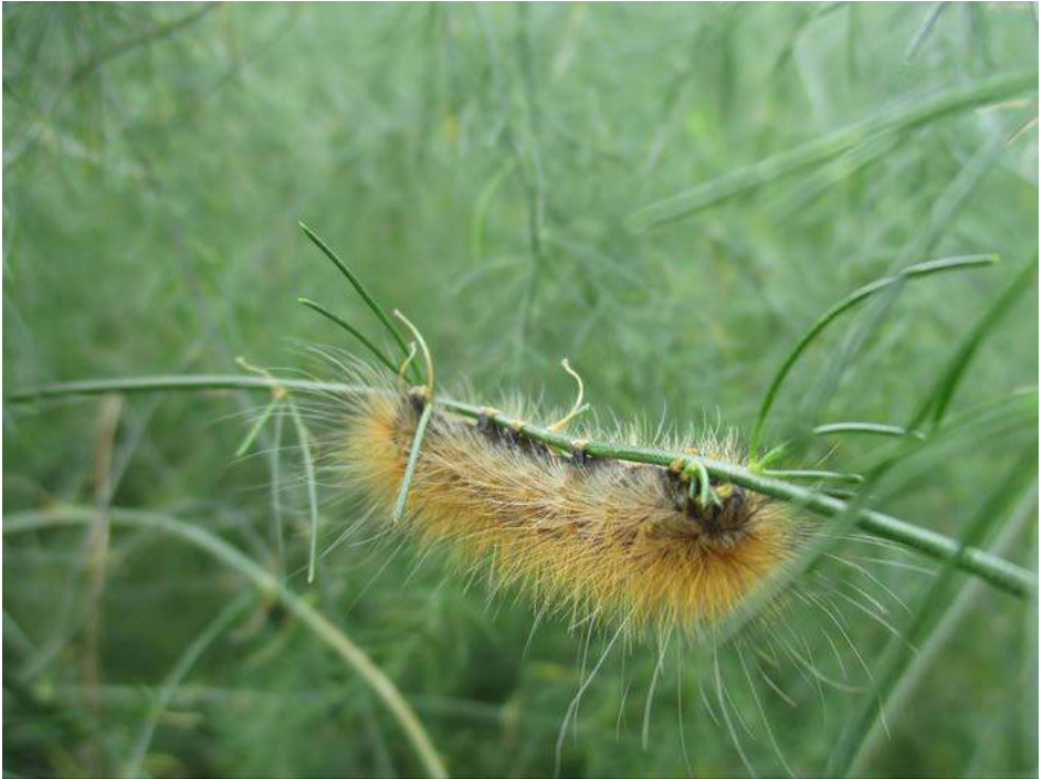
Among the Asparagus, photograph, Canon Powershot Elph160