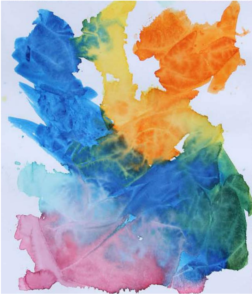
Untitled , tempera, watercolor, cellophane