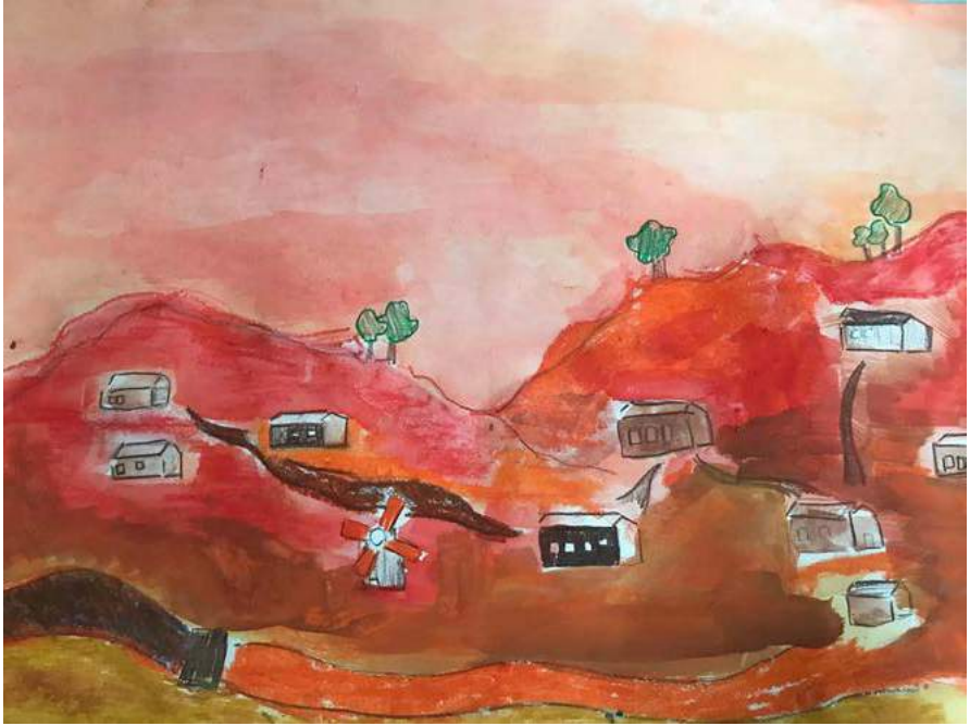
Orange Landscape, watercolor and colored pencils